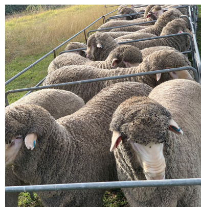
2021 Sale rams on display