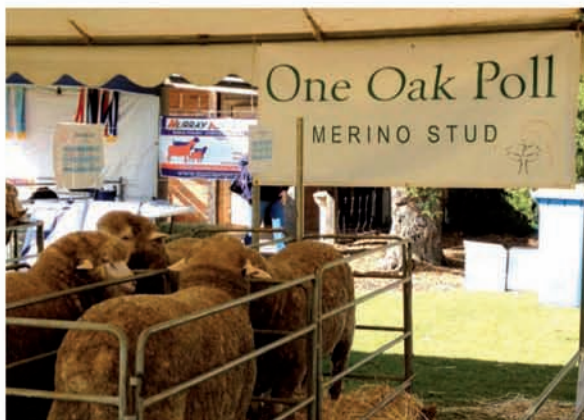
Above: One Oak Poll rams on display at Deniliquin Expo